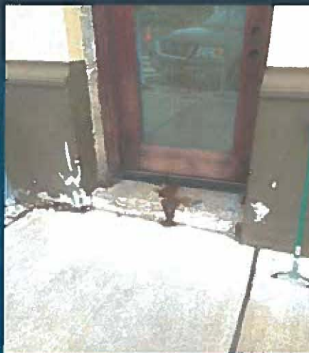
12 th & Tacoma Ave