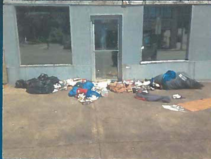
13 th & Tacoma Ave