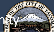
Employee Racial / Ethnic Diversity EOY 2021 Environmental Services Only