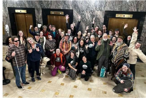
Members of the Tacoma Psychedelic Society celebrated in city hall after the vote