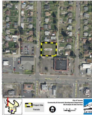
City of Tacoma | Proposed Property Tax Exemption Project 619 N. Rochester St. -- Parcel 4470000471