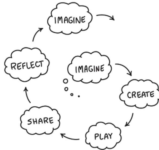
Creative Learning Spiral. (Resnick, 2017)