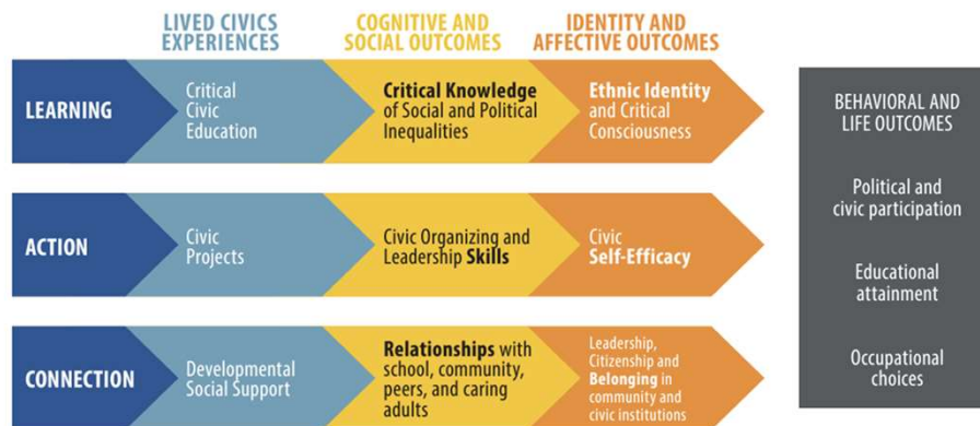
Figure 2: Elements and Outcomes of Asset and Action-Based Civic Experiences