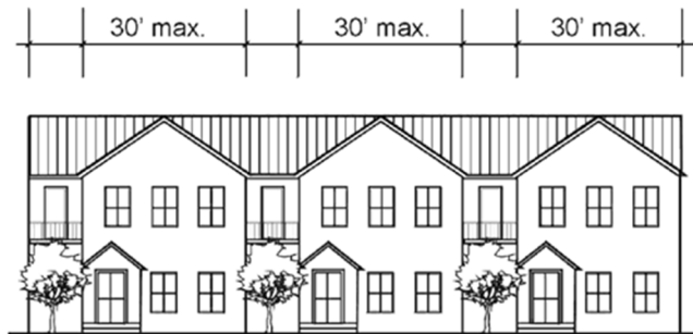
Above: Residential building articulation at intervals of 30-foot or less.