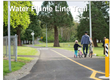
Connect Tacoma will invest in:

These improvements make it easier for people to walk, bike, roll, and take transit, while connecting neighborhoods to the places people go every day.