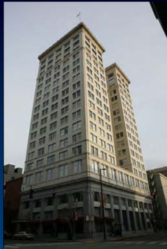
West and South elevations

City Council Meeting June 27, 2017 Resolution 39758