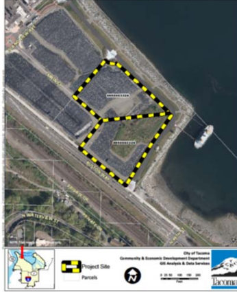
City of Tacoma | Proposed Property Tax Exemption Project 4901-4911 Main Street – Parcels 8950003328 & 8950003329