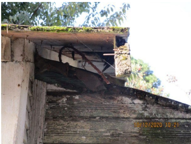
Substandard - Ok to live in but needs repairs

Derelict - a structure that is meant for living but required amenities are missing