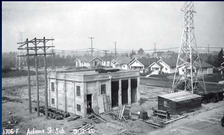
1706-F Adams St. Sub. 9-12-25