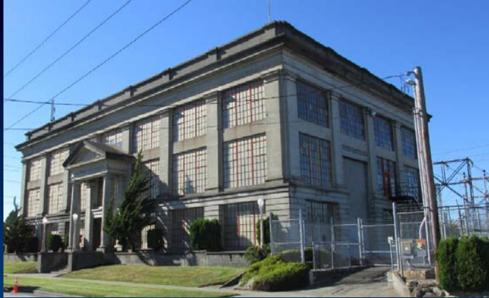
Front façade, Cushman Substation, 2016