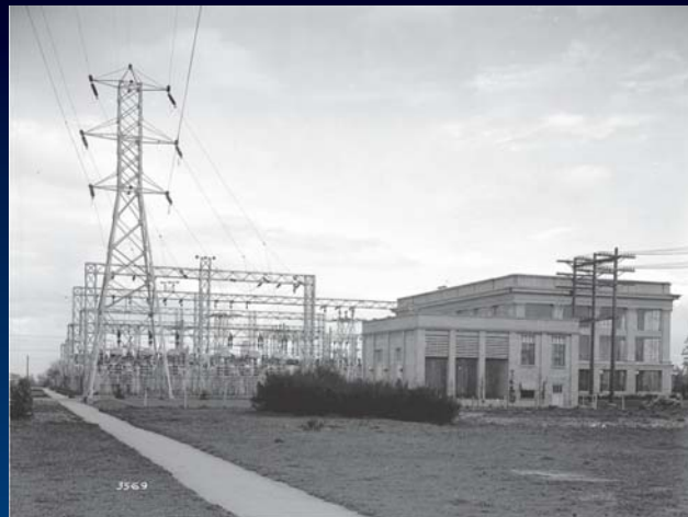
Historical view of the complex looking east, April 13, 1937.