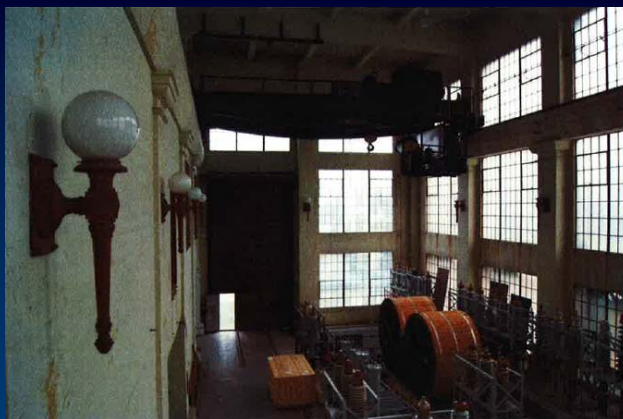
Present day view of the interior condenser room