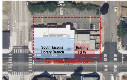
Existing Fire Station #7 South 56th Street and South Warner Street