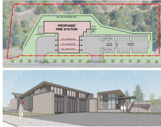
Preliminary Fire Station Concepts