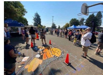
City of Tacoma Neighborhood Planning Program 3