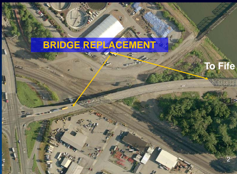
Puyallup River Bridge Map

City Council Meeting March 1, 2016 Item # 8 Resolution 39393