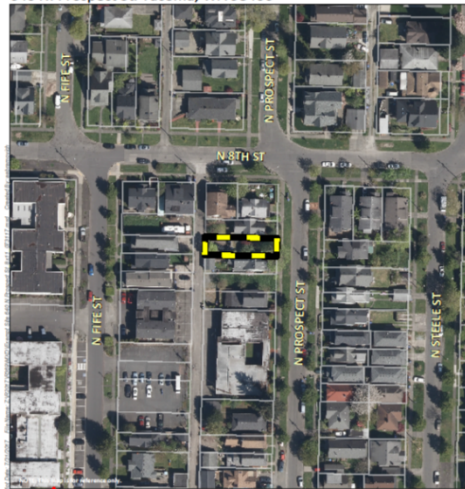
City of Tacoma | Proposed Property Tax Exemption Project 640 N. Prospect St. Tacoma, WA 98406