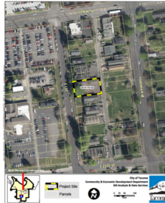
City of Tacoma | Proposed Property Tax Exemption Project 1925 S. I Street -- Parcel 2019170120