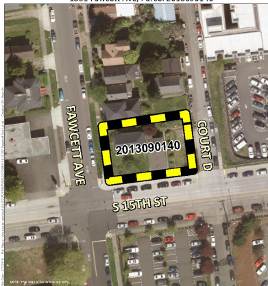
City of Tacoma | Proposed Property Tax Exemption Project 1351 Fawcett Ave, Parcel 2013090140