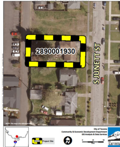
City of Tacoma | Proposed Property Tax Exemption Project 4524 S. Junett, Parcel 2890001930