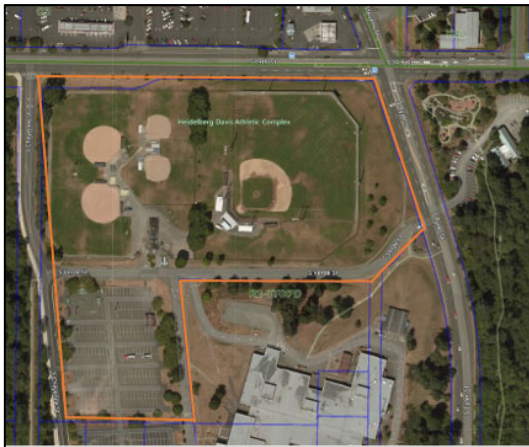
Figure 1. Heidelberg-Davis Site (S. 19th St. & S. Tyler St.)