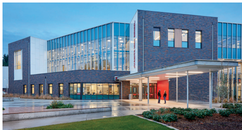
Juanita High School

“We take great pride in our work, and we are committed to putting our very best into every project, every day.”