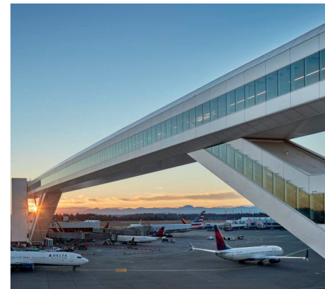
Seattle-Tacoma International Airport (SEA) International Arrivals Facility

“We delight and deliver value to our clients and project partners, provide diverse opportunities for the Clark team, and enhance the communities where we live.”