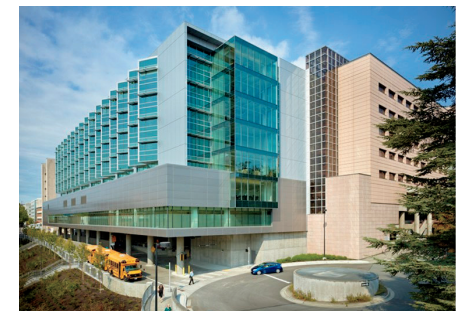
University of Washington Medical Center, Montlake Tower Expansion

“Whether we are building schools to provide inspiring spaces for learning, roads to connect communities, or hospitals to care for patients, it all contributes to our purpose – we build for a better society.”