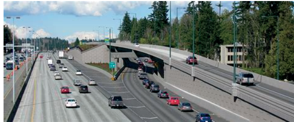
I-405 – SR 520 Bellevue Braids

“With each project we undertake, exceeding our clients’ expectations is our ultimate goal.”