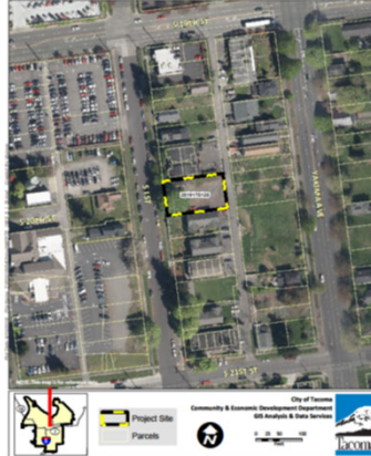
City of Tacoma | Proposed Property Tax Exemption Project 1925 S. I Street -- Parcel 2019170120