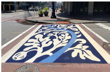
Example product (Eugene, OR)