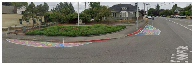
Artistic bulb outs at Division Lane and McKinley Avenue