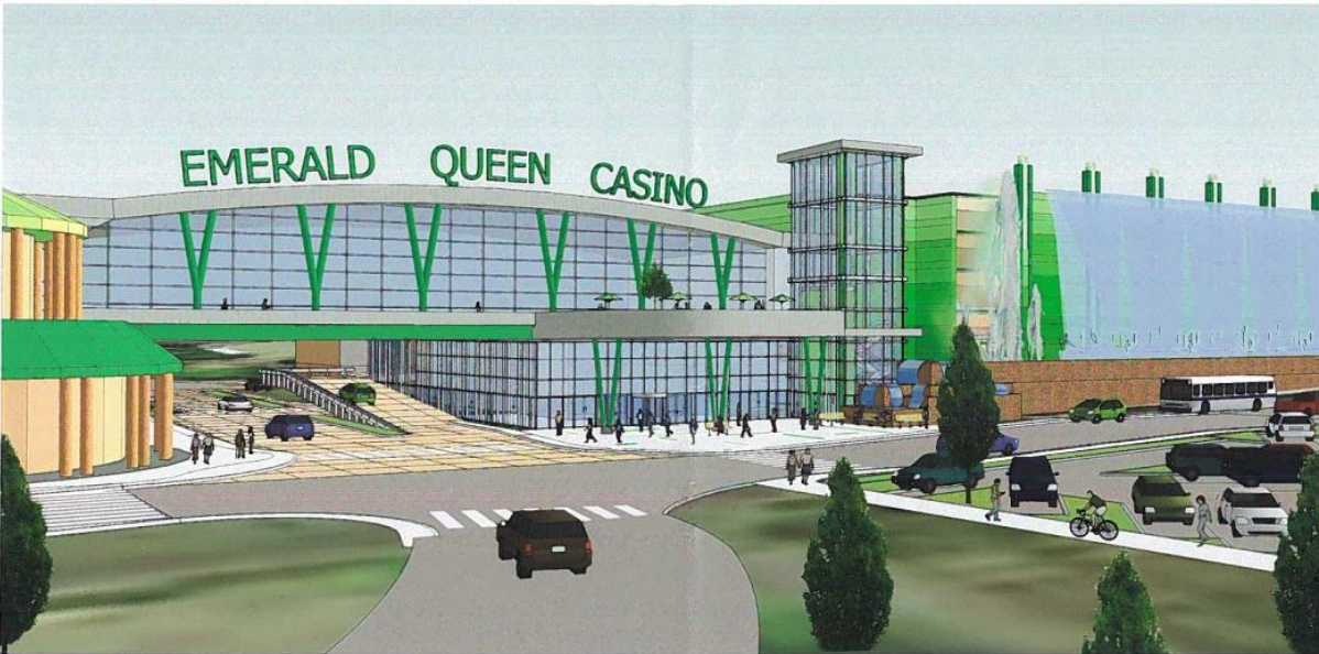
CONCEPTUAL DESIGN SKETCH

PUYALLUP TRIBE OF INDIANS EMERALD QUEEN CASINO | 12.3.2014