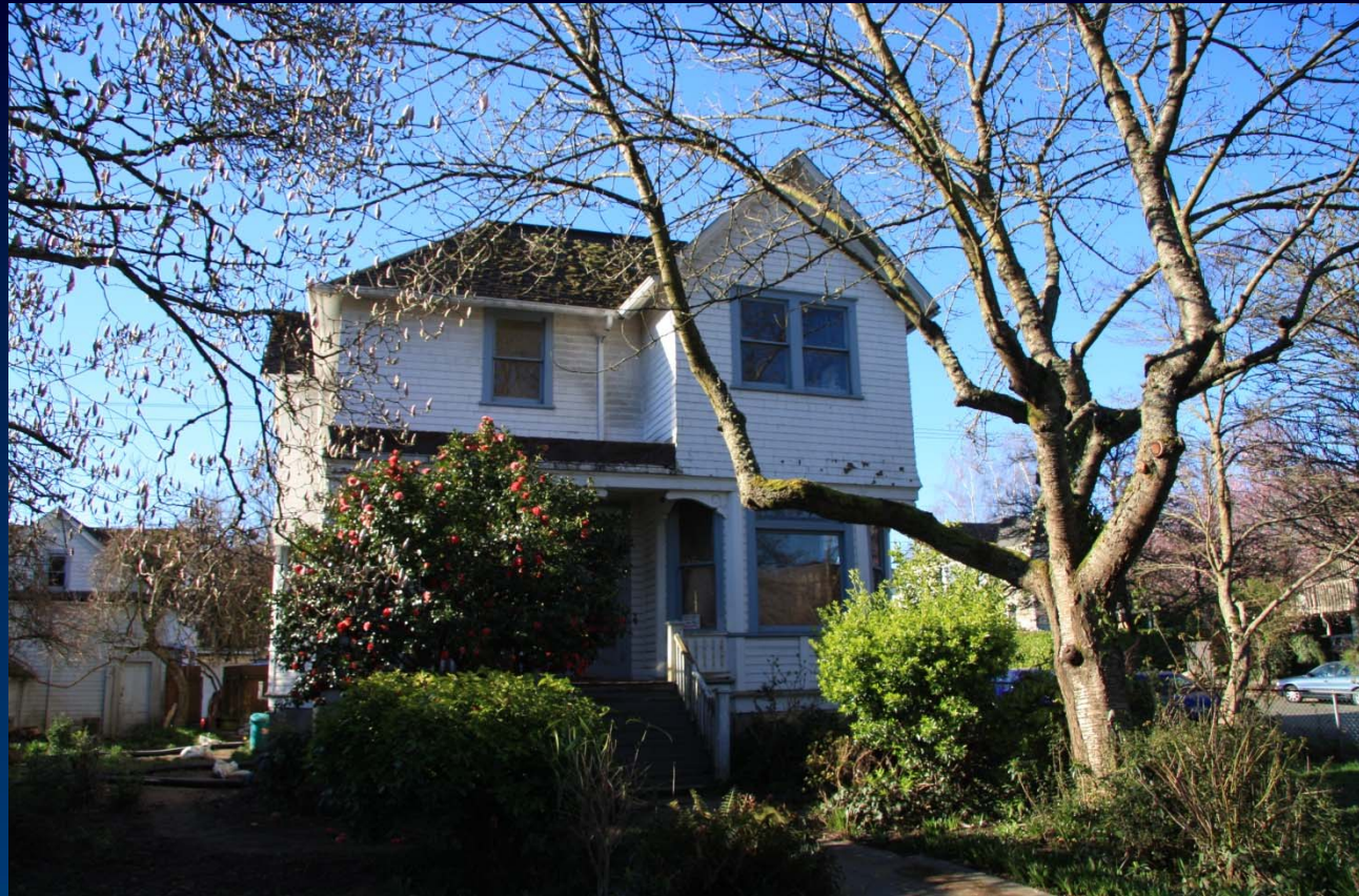
Born-Lindstrom House, northeast elevation