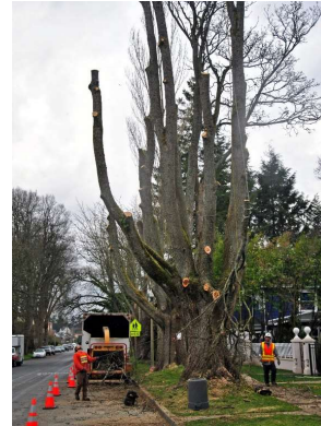
North Yakima Tree Removal