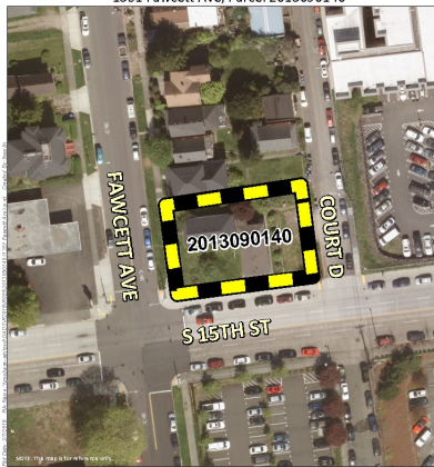
City of Tacoma | Proposed Property Tax Exemption Project 1351 Fawcett Ave, Parcel 2013090140