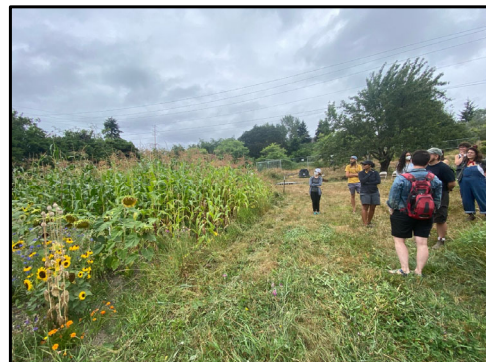
Colibri Farm – Tacoma Recovery & Transfer Center