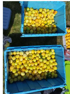
Fruit Tree Gleaning

After the fact permit required for “Emergencies”