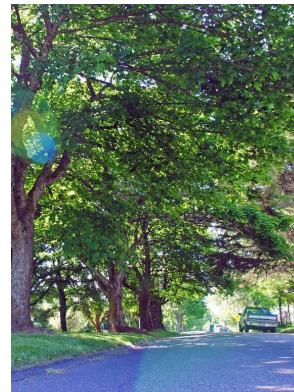
Tree Lined North Union Ave