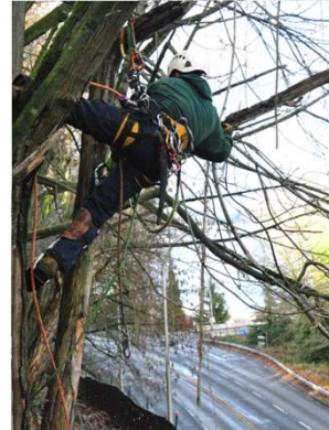
Schuster Pkwy Tree Pruning