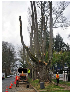
North Yakima Tree Removal