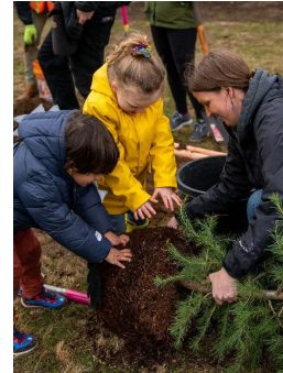
Tree Planting at Madison School