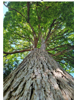
State Champion Elm Tree in Wright Park