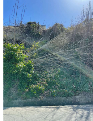
Illegal Tree Removal Over Roadway