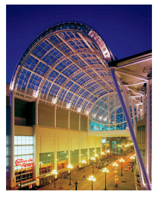
Washington State Convention Center

"No job is too large, too small, too complex, or too challenging for Kiewit." Regardless of a project's scope, Kiewit works to meet its clients' needs in the timeliest and most cost-efficient way, while always remaining focused on quality and safety."