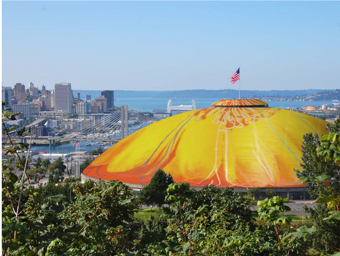
Test Pattern Update – Tacoma Dome