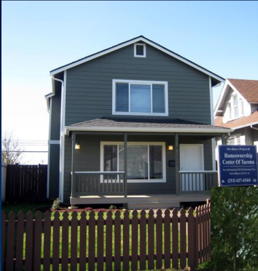
1254 S Grant