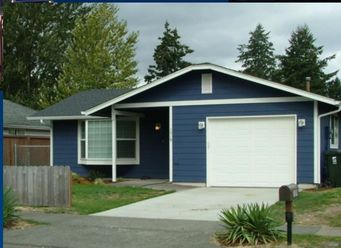
1519 S 93rd