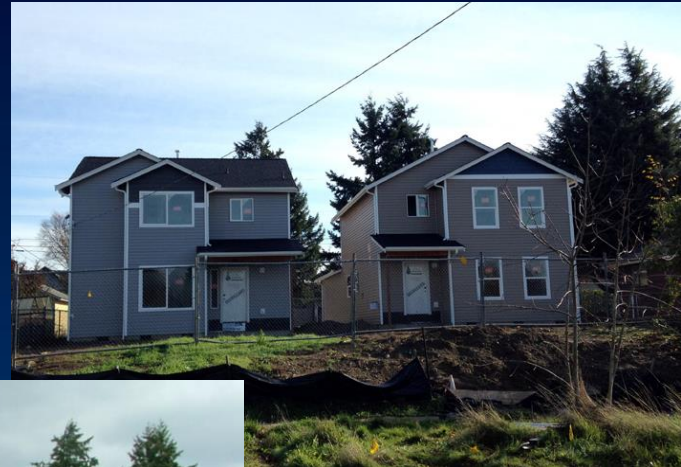
3581 East E