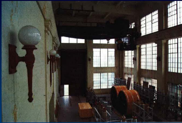
Present day view of the interior condenser room