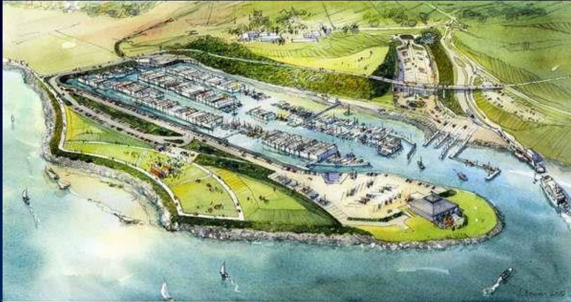
Site Workshop | Stephanie Bower, Architectural Illustration