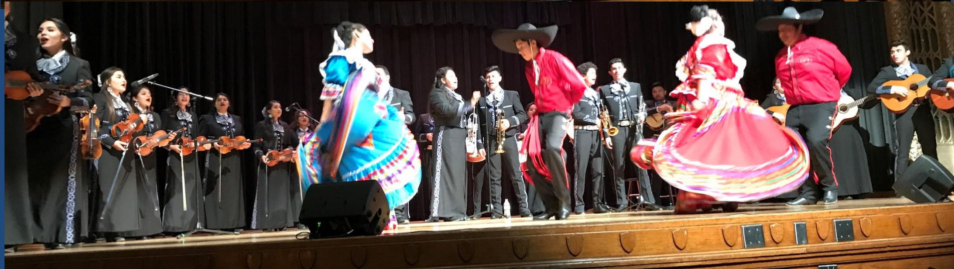
LatinX Festival at Lincoln High School