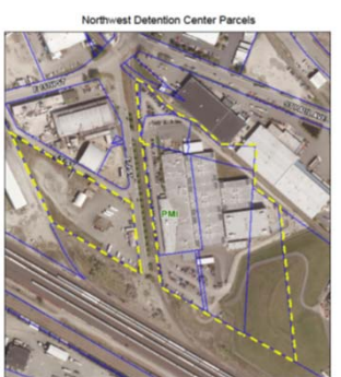
Northwest Detention Center