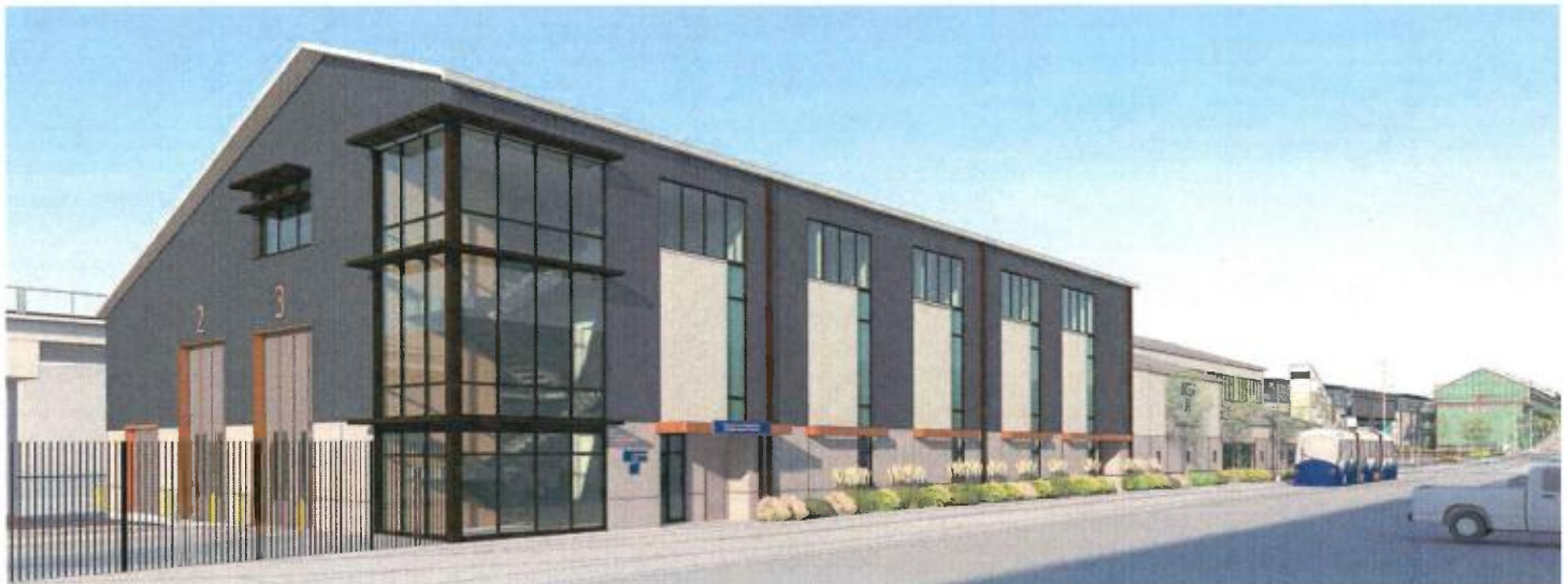
Expansion of the Operations and Maintenance Facility on East 25th Street