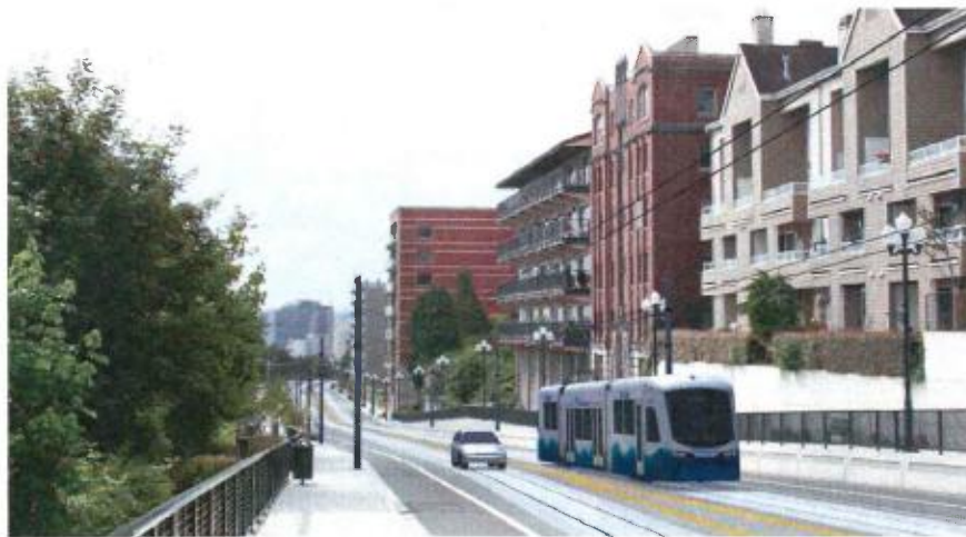
Looking south down Stadium Way near Division Avenue*

*Simulations reflect an earlier design phase and show a two wire overhead contact system (OCS). Recently, Sound Transit has selected a single wire instead of a two wire OCS. Simulations are intended to show the project location and visual changes. They do not illustrate other potential station or design amenities.