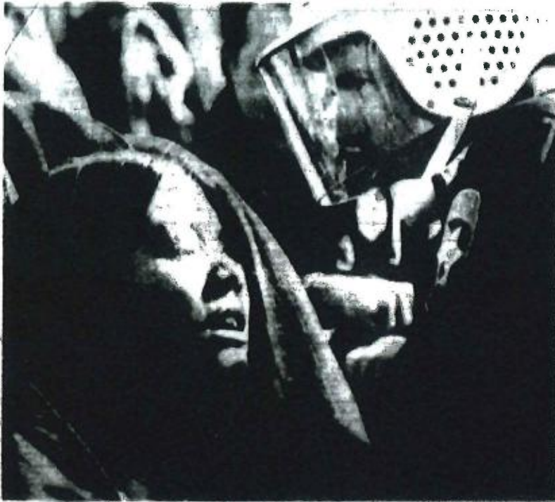
A Tacoma police officer held an Indian woman arrested today when Indians, police and state officials clashed at the Puyallup River.