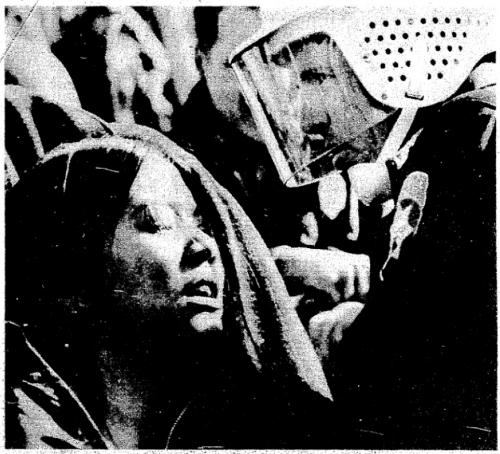
A Tacoma police officer held an Indian woman arrested today when Indians, police and state officials clashed at the Puyallup River.