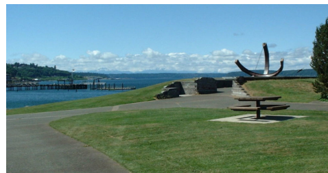
Jack Hyde Park, named in 2002