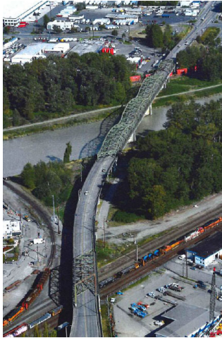
Fishing Wars Memorial Crossing, named in 2019