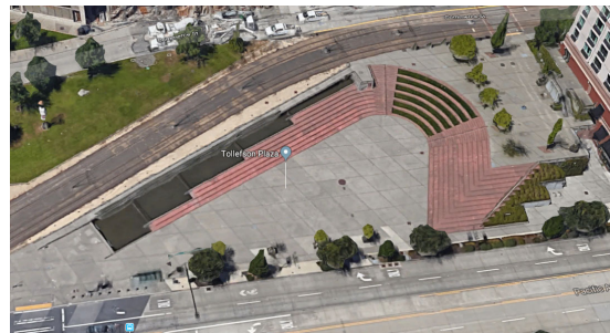
Tollefson Plaza, named in 2006