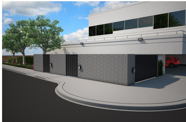
Proposed - Draft