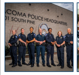
Police Staffing Study $87K