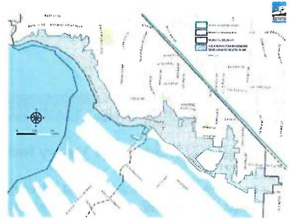
Map above: Area of Applicable Residential Development Restrictions.