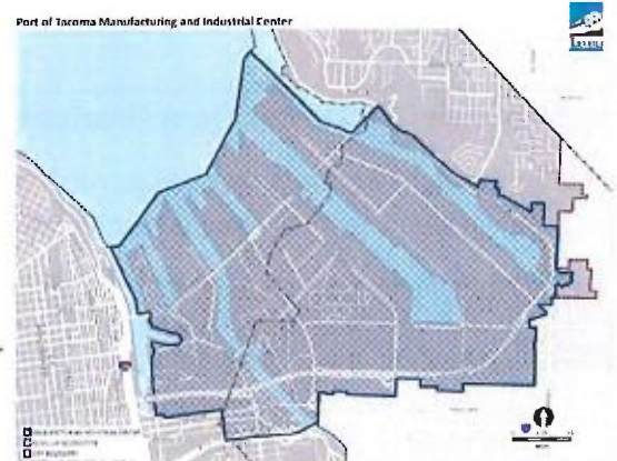
Map above: Port of Tacoma Manufacturing and Industrial Center.