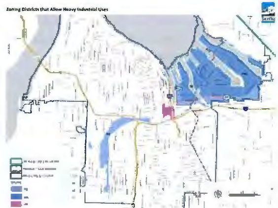
Map above: Zoning Districts that Allow Heavy Industrial Uses.