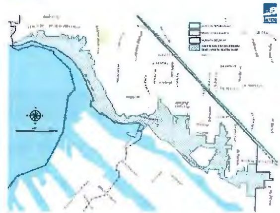
Map above: Area of Applicable Residential Development Restrictions.