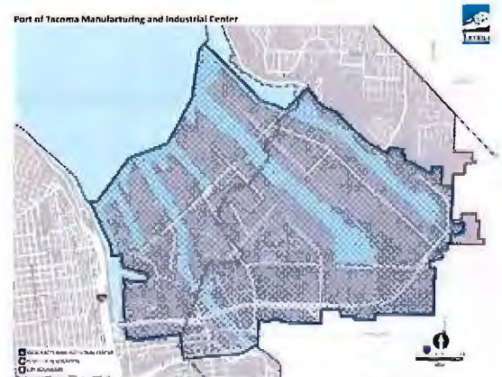
Map above: Port of Tacoma Manufacturing and Industrial Center.