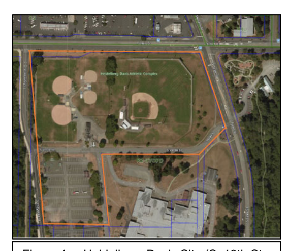
Figure 1. Heidelberg-Davis Site (S. 19th St. & S. Tyler St.)

Proposed by the Planning and Development Services Department and the Public Works Department, this application compiles 35 minor and non-policy amendments to the One Tacoma Comprehensive Plan and the Land Use Regulatory Code, intended to update information, correct errors, address inconsistencies, improve clarity, and enhance applicability of the Plan and the Code.