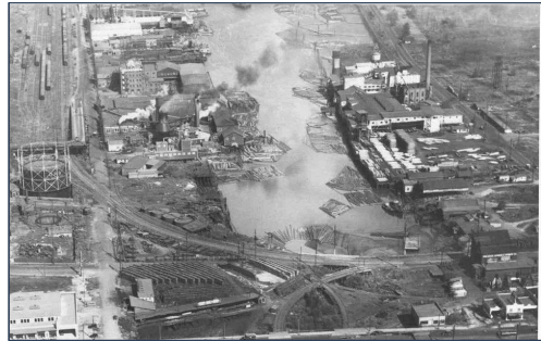
Circa 1928