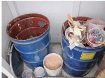
Open containers of dangerous waste.

If left unattended or improperly disposed of, the materials pose risks to health and safety.