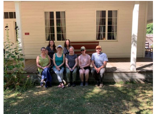
Landmarks Preservation Commission site visit, Ft. Nisqually Clerks House project