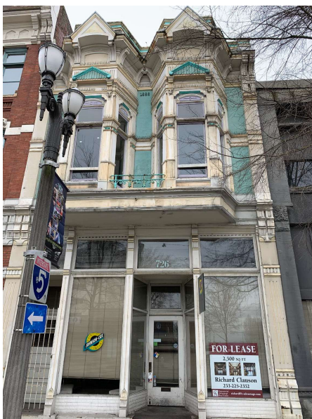
Morning Globe Building, Old City Hall Historic District