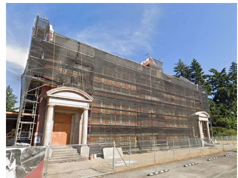
Photos, Top: Oakland School under construction; Bottom: Community Kick Off Hilltop Pavers & Plaque Project.