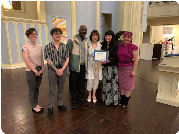
Historic Preservation Awards Ceremony, 2025