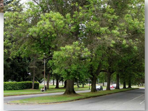
Top: Swanson Residence, Bottom: North Union Avenue Greenway