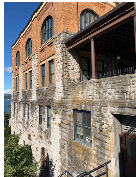
Stadium High School, undergoing exterior cleaning and maintenance