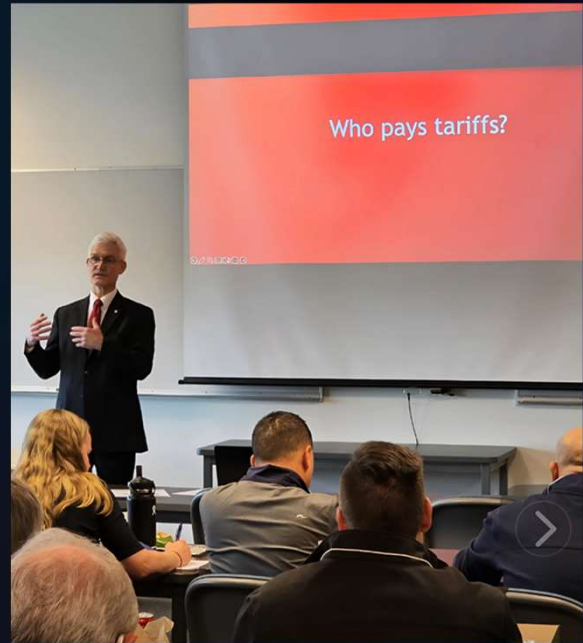
Keynote Address at the Center for Advanced Manufacturing of the Puget Sound